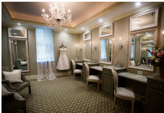
This private suite is located on the 3 rd floor of our hotel

Our luxurious prep suite features multiple vanities, elegant lighting, and a full bathroom, making it easy to perfect your hair, makeup, and wardrobe before walking down the aisle.